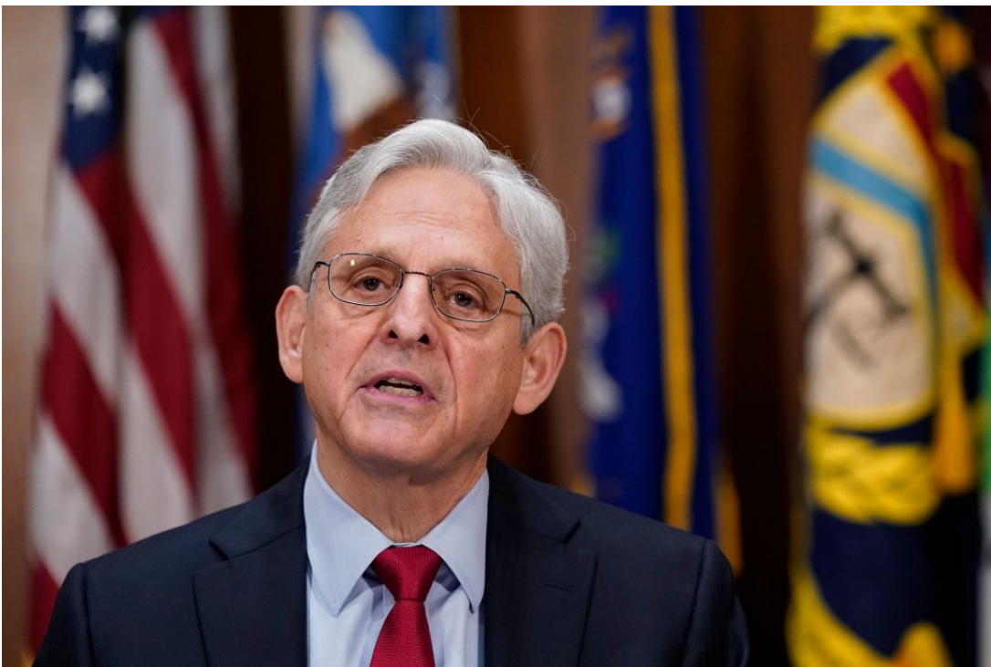
Merrick Garland has sat on the 4-year-old probe of Hunter Biden over taxes and lobbying.

He, too, cited potential "hack and leak" operations, but reportedly could not recall if he mentioned Hunter Biden's name.