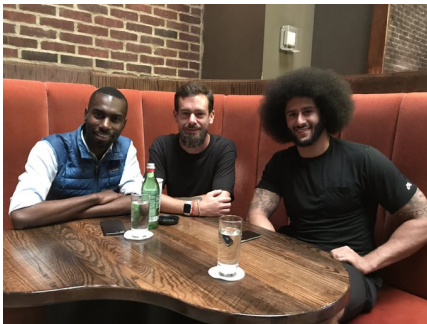
Magic Coffee Shop .

♦ Elevator Speech: Twitter is to the U.S. government as TikTok is to China. The overarching dynamic is the need to control public perceptions and opinions. DHS has been in ever increasing control of Twitter since the public-private partnership was formed in 2011/2012. Jack Dorsey lost control and became owner emeritus; arguably, Elon Musk has no idea (you'll see proof toward the end).