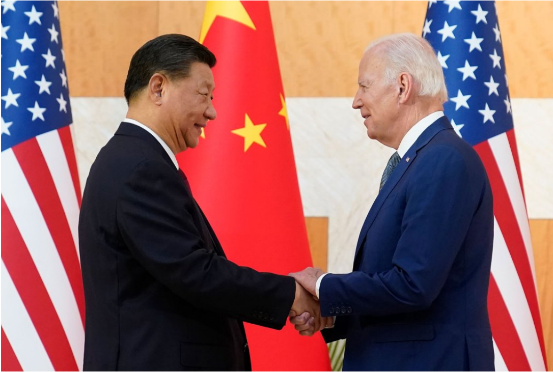
Xi Jinping knows if there was a quid pro quo for the many millions the Biden family got from China.

The suit cites numerous areas of government suppression, including the laptop story, the lab leak theory of COVID-19's origin, the efficiency of masks and COVID-19 lockdowns and election integrity issues. The consistent charge is that the feds label content they don't like as "disinformation," "misinformation" and "mal-information," then lean on Facebook, Twitter and others to block that content from being shared or seen by users.